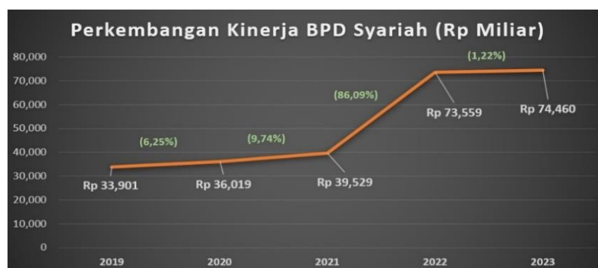
Picture 1. Asset Development of Islamic RDBs for the 2019–2023 Period

The surge in asset growth reflects the increasing profits earned by the institutions, which in turn could serve as a foundation for future business development [4, p. 85]. Through such development, these institutions are expected to provide greater contributions to society while strengthening their role in the economy. Accordingly, the progress of Islamic RDBs can be considered increasingly positive as it aligns with their original purpose. To illustrate this progress, the asset growth trend of Islamic RDBs during the 2019–2023 period is presented below: